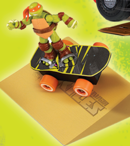
Sewer Spinnin' Skateboard*