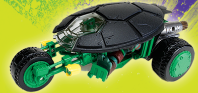
Ninja Stealth Bike